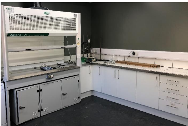
HSE licenced process and research laboratory.