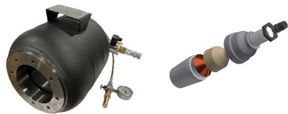
Design, development and test facilities for manufacture of energetic components.