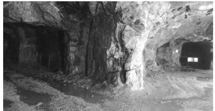
The geology of the mine is an igneous intrusion principally of granite with some minor mineral veins.